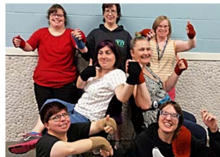
Knitters and Gloves!