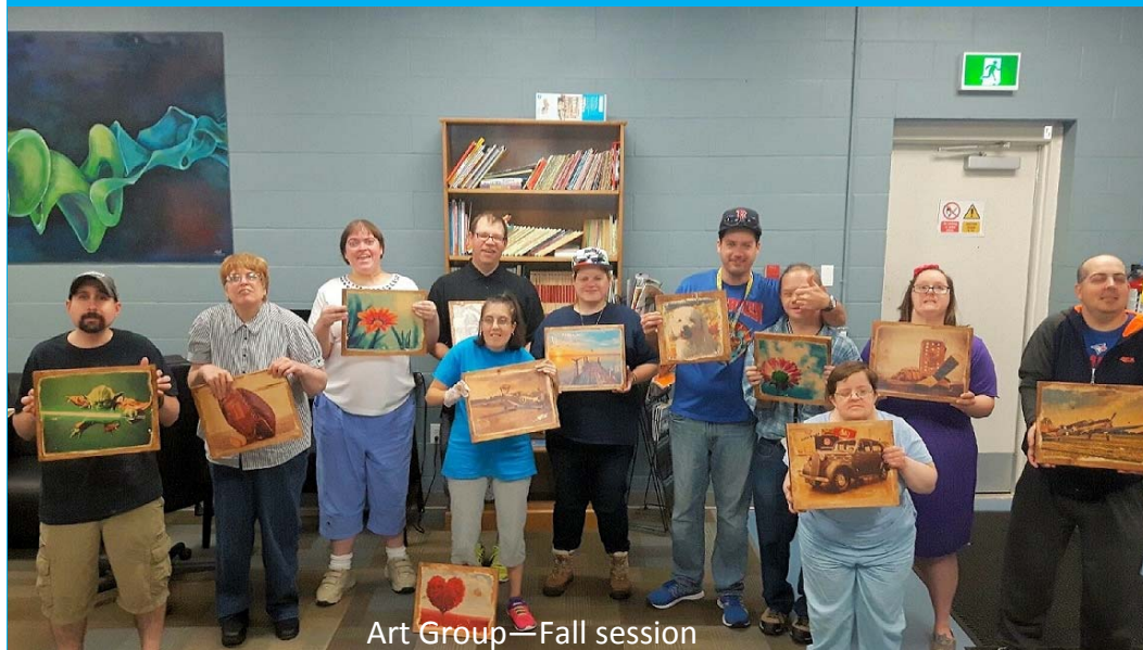
Art Group—Fall session

Look at what we accomplished together! Thank you!