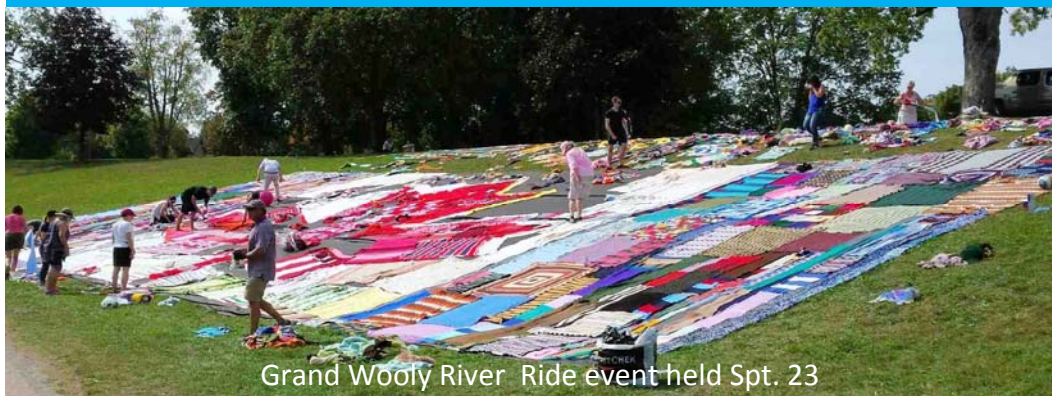
Grand Woolly River Ride event held Spt. 23